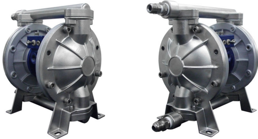
70-254 DOUBLE DIAPHRAGM PUMP (BARE PUMP)