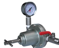
Fluid Regulator 52-203