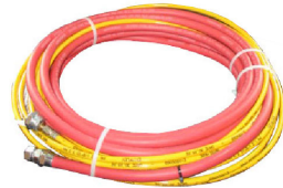
AAA 25' Hose Set (Available in 35' & 50' Sets)