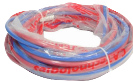
AAA 3/16" Fluid Hose 1/4" Air Hose