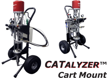
CATALYZER™ Cart Mount