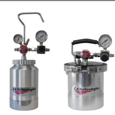
2 Quart Pressure Cups