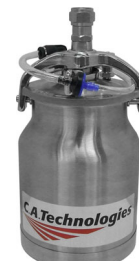
1 Quart Stainless Steel Pressure Cup 51-303SS