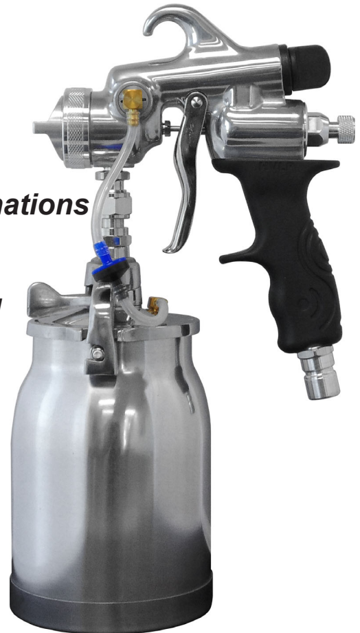
HVLP Turbine Gun and Cup Combo 60-TRBN-2