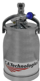
1 Quart Aluminum Pressure Cup 51-303